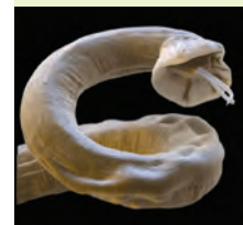
Electron micrograph of an adult lungworm

Angiostrongylosis, caused by the parasite Angiostrongylus vasorum , has been present in the UK and the Republic of Ireland for the last 40 years in patches or "hotspots", but is now spreading North across the British Isles. While still relatively uncommon in the North, new cases are being identified all the time. It is also known as the French/ small heartworm or lungworm (to distinguish it from Dirofilaria – the large heartworm found in mainland Europe and the USA).