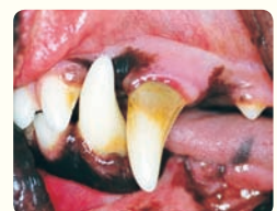
Photo of gum disease in an adult dog. Note the build up of yellow calculus.